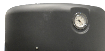
Indicateur de colmatage