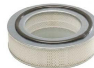
Option : Filtre absolu en amont (HEPA) avec filtre M