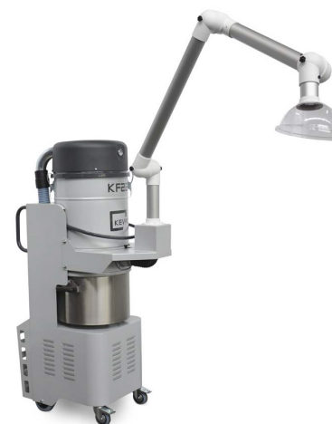
OPTION : Bras d'aspiration