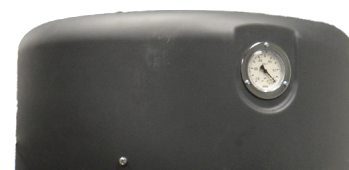
Indicateur de colmatage