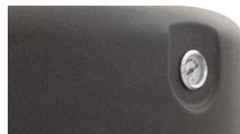
Indicateur de colmatage