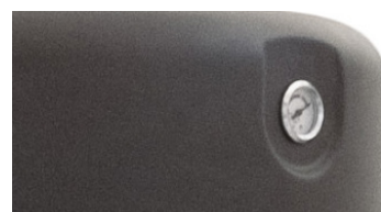
Indicateur de colmatage