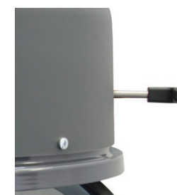
Système de décolmatage ergonomique