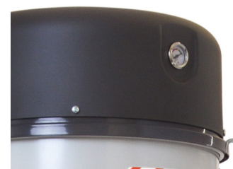
Indicateur de colmatage