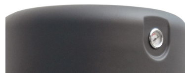
Indicateur de colmatage